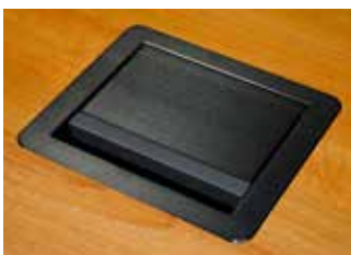
A/V Table Box