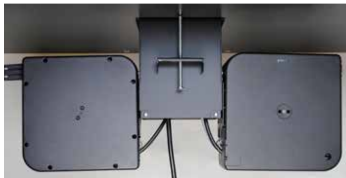
InteGreat Cable Retractors protect cables while keeping them neat and organized.

InteGreat Cable Retractors attach easily to InteGreat A/V Table Boxes, or can be mounted directly to the underside of conference room tables. InteGreat Cable Retractors have 5' [1.52m] of retractable cable that allows users to have easy access to A/V and communication services. With a simple pull, the cable locks into place or retracts back into the table box, keeping the conference room table neat and organized.