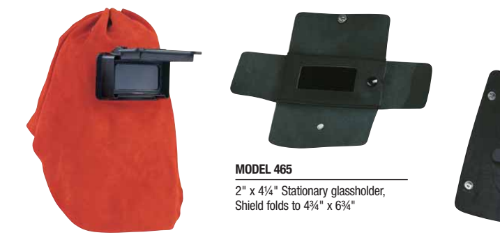
MODEL 870 LIFT FRONT Welder can lift lid to position or inspect work.