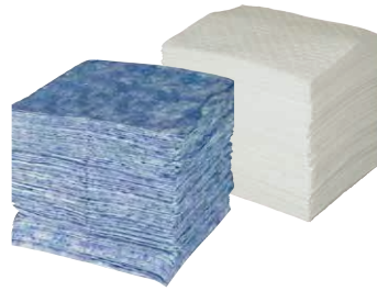
SPC105 features blue coverstock on one side.