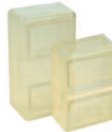
Rubber Boot for Twin Actuators Color: Clear Cat. No. 2ATBT7 (Non-Illuminated) 2ATLBT7 (illuminated)