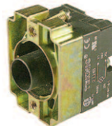
Bulb Holder for Illuminated Push Buttons Cat. No. 2LHB