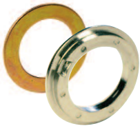
Adapter for installing a Ø22.5 device in Ø 30.5 cutout Cat. No. 2ADP (with washer) ADW (washer only)