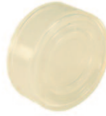
Transparent Silicone Rubber Boot for Flush Actuators Color: Clear Cat. No. 2BT7 (for non-illuminated) 2ALBT7 (for illuminated)