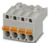
PCB connector, nominal cross section: 2.5 mm 2 , color: light gray, nominal current: 12 A, rated voltage (III/2): 320 V, contact surface: Tin, type of contact: Female connector, Number of potentials: 3, Number of rows: 1, Number of positions per row: 3, number of connections: 3, product range: FKCT 2,5/..-ST, pitch: 5 mm, connection method: Push-in spring connection, conductor/PCB connection direction: 0 °, Locking clip: - Locking clip, plug-in system: CLASSIC COMBICON, Locking: without, type of packaging: packed in cardboard

Printed-circuit board connector - FKCT 2,5/ 3-ST KMGY - 1998263