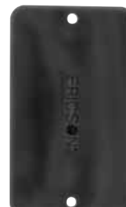
Catalog Number - 6034B