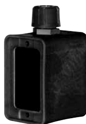
Standard Depth Catalog Number - 6130B