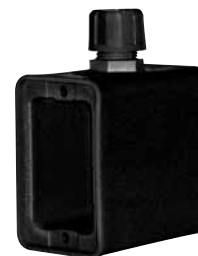
Extra Deep Catalog Number - 6129B