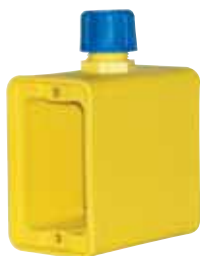
Extra Deep Box Catalog Number - 6129