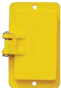
For GFCI Receptacles Catalog Number - 6135Y