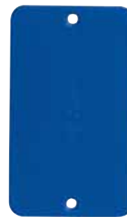
Blank Cover plate Catalog Number - 6034