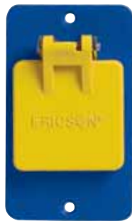
For Single Receptacles 1.572" Dia. Opening Catalog Number - 6133