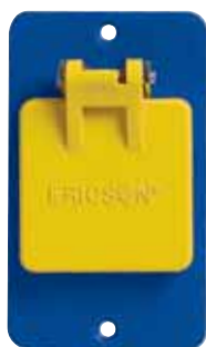
For Single Receptacles 1.390" Dia. Opening Catalog Number - 6132