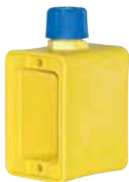
Standard Depth Catalog Number - 6130