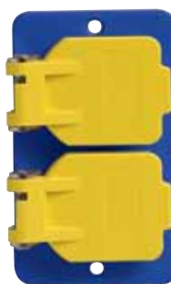
For Duplex Receptacles Catalog Number - 6131