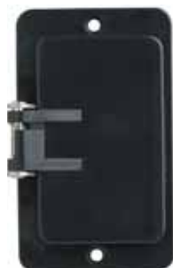
Catalog Number - 6135