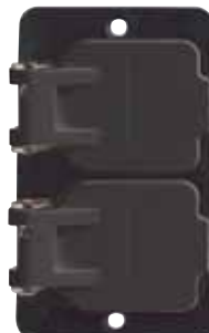
Catalog Number - 6131B