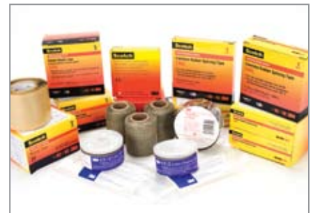
3M™ Mining Cable Splice Kit 3103