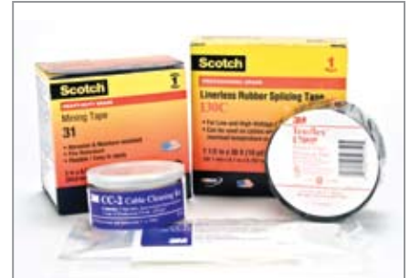
3M™ Mining Cable Splice Kit 3100