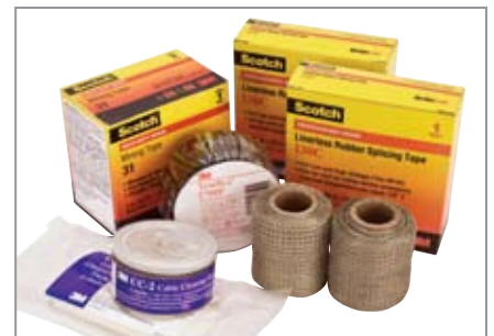
3M™ Mining Cable Splice Kit 3104