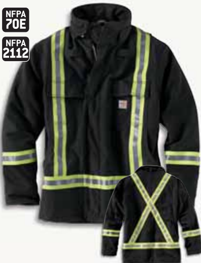
Back of Coat