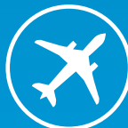
Aerospace & Defense