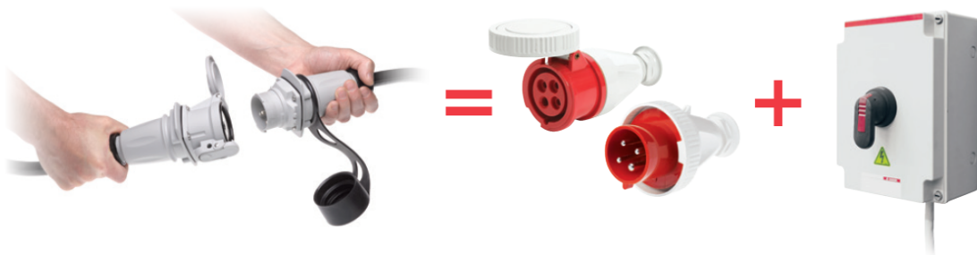
Woodhead ArcArrest 30A Switch-Rated Connector

Unlike standard connectors, switch-rated devices listed under UL 2682 can operate as switches and be used to disconnect loads while energized. When operated under load, arcing will occur between the male and female contacts, which they can withstand without damage. The user is completely shielded from this energy because the plug maintains a connection with the receptacle during operation. A twisting motion must be applied by the user to remove the plug after the circuit has been interrupted. The UL test requires this live switching to occur 6,000 cycles. This proves the connector's ability to last for many years in a typical industrial application.