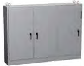
UHD Heavy Duty Disconnect Enclosures