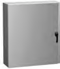
EN4DSC Single Door Disconnect Enclosure