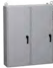
2UD Double Door Disconnect Enclosures