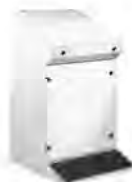
Series 2000 Console