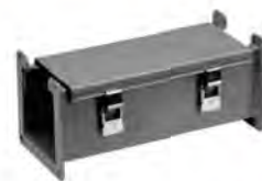
1485 Wiring Trough