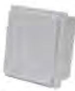
PJ Raised Lid Polyester Enclosure