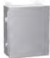
1414 NEMA 4X Stainless Steel Enclosure