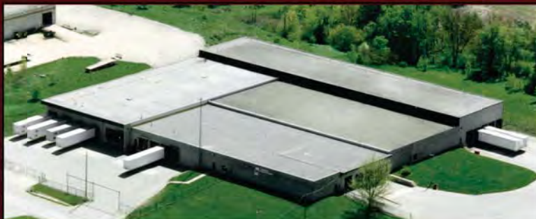
Hammond Distribution Center

We've committed our people and resources to ensuring you get exactly what you need, when you need it.