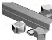
Type 1 Lay-In