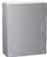
Eclipse Stainless Steel Enclosure