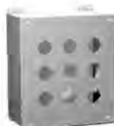
1437 Pushbutton Enclosure