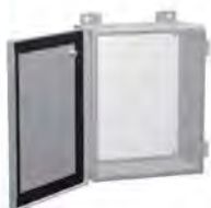
1414 NEMA 4 PH Enclosure