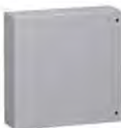
Eclipse Single Door Enclosure