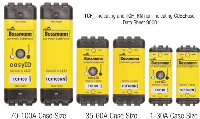
TCF_ Indicating and TCF_RN non-indicating CUBEFuse. Data Sheet 9000

The indicating Low-Peak® CUBEFuse® (TCF_) and non-indicating Low-Peak CUBEFuse (TCF_RN) are available in amp ratings from 1-100A. See Data Sheet 9000. The CUBEFuse is also used in these other Cooper Bussmann® circuit protection solutions.