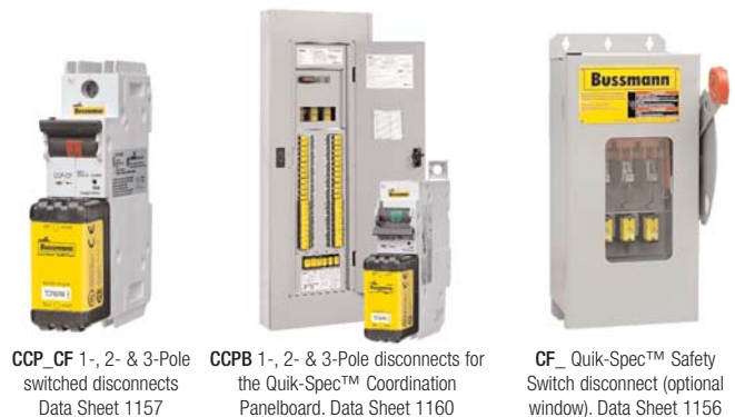
CCP_CF 1-, 2- & 3-Pole switched disconnects Data Sheet 1157