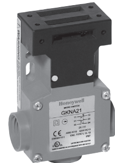
24CE and 924CE Series